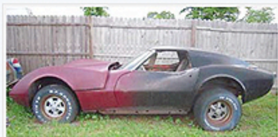
Some Maco kit cars didn't turn out so good.